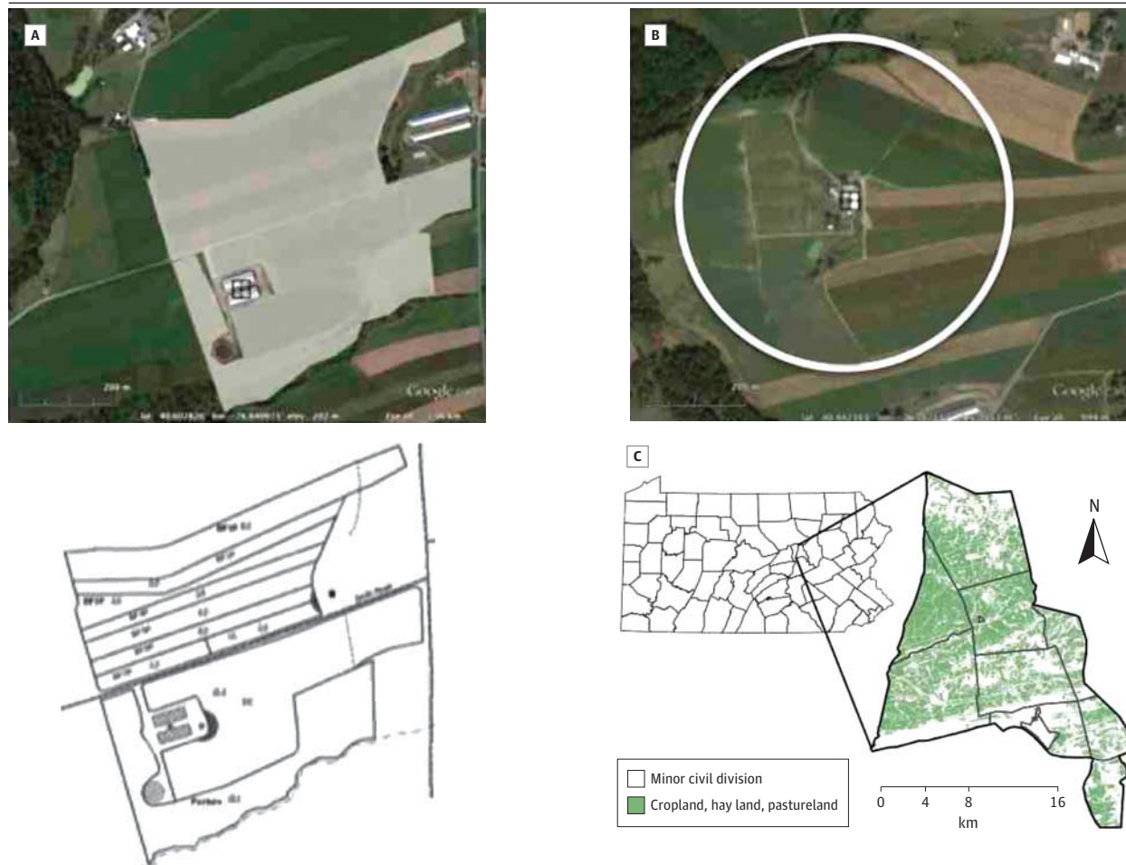
Figure 2. Three Methods Used to Identify and Locate Crop Fields

A, Aerial photograph (top) or map (bottom) were located using Google Earth (n = 135). B, Operation addresses known and located using ArcGIS, version 10 (Esri) (n = 420). C, County and township known and addresses were located by